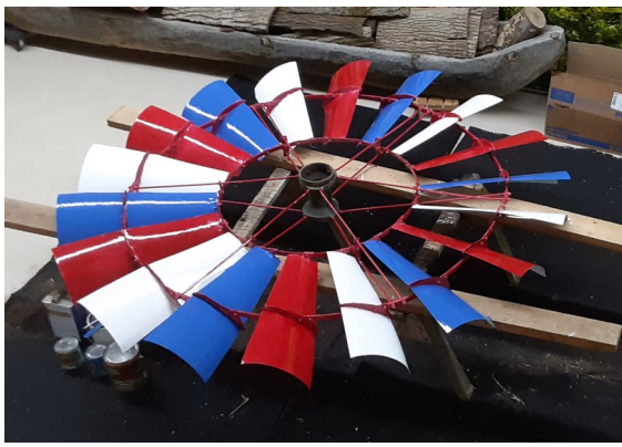
Painted Windmill Blades

The 2023 Museum Guide will feature General Stores of the area. If you have pictures and stories please share.