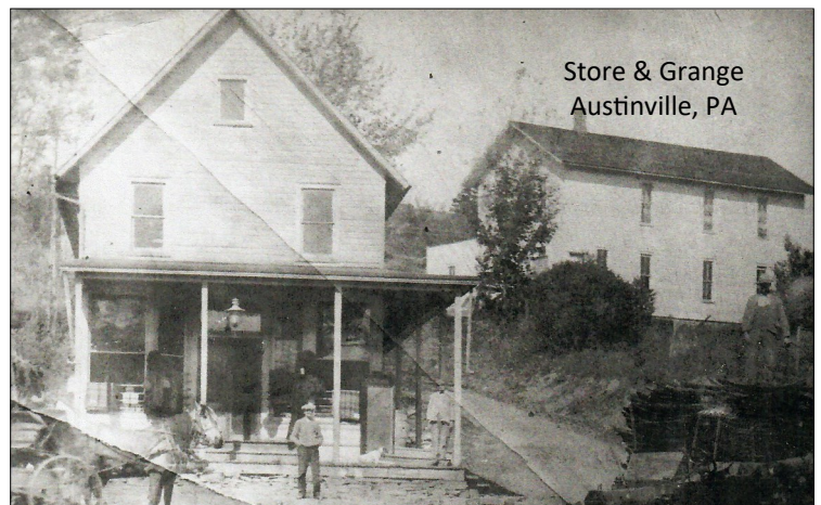
Store & Grange Austinville, PA

Items can be dropped off any Tuesday 9-3