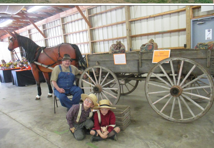
Closing for the season Tues Oct 31.