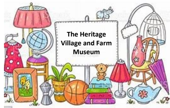
The Heritage Village and Farm Museum