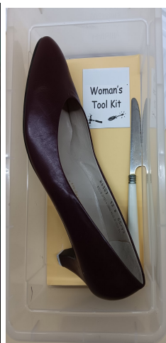
Woman's Tool Kit