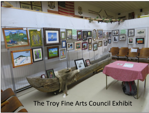
The Troy Fine Arts Council Exhibit