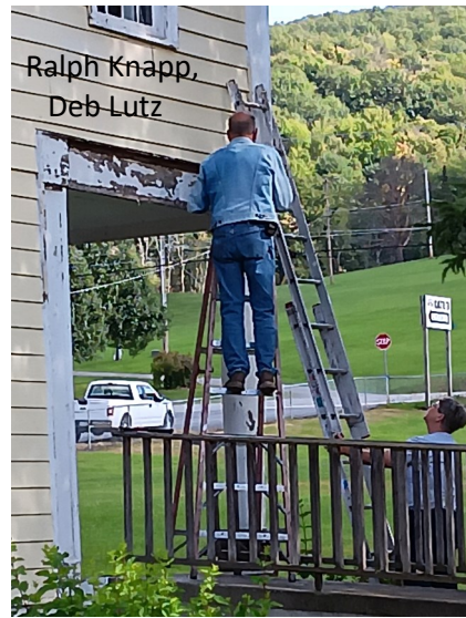
The back porch of the Inn was power washed, the Inn wall, doors and window frames painted. windows washed, one window replaced. The railing got a coat of clear finish. The sitting bench was painted and electric wiring updated. Yet to do set - up the back porch exhibit.