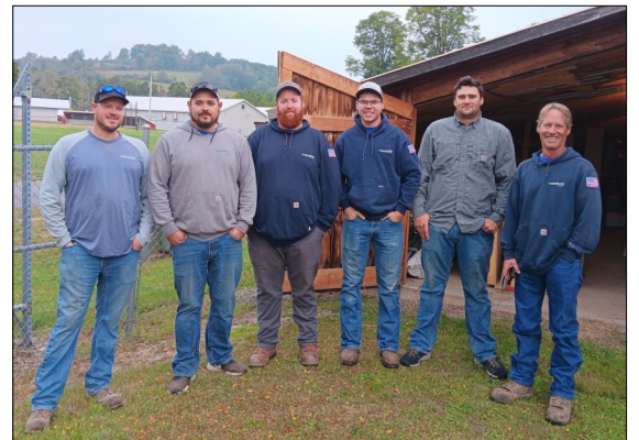
BCHA Party Line September 2024