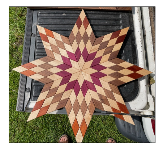
Ralph Wilston will demonstrate building a wooden quilt block.