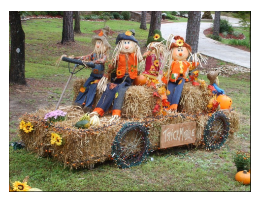
We're headed to the Pennsylvania Heritage Festival for some Family Fun