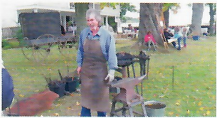
Living History Demonstrations

Hosted by the Heritage Village & Farm Museum of Troy, PA