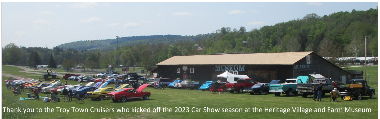
Thank you to the Troy Town Cruisers who kicked off the 2023 Car Show season at the Heritage Village and Farm Museum

The Heritage Village and Farm Museum presented a float demonstrating the practice of placing flags on the graves of fallen soldiers.