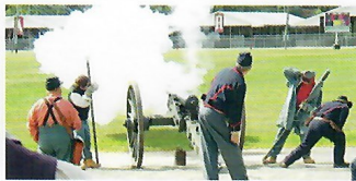
Civil War Reenactments, Encampment & more!