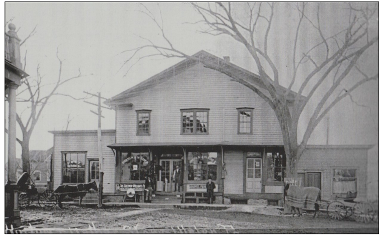
Horton and Mather General Store Ulster, Pennsylvania