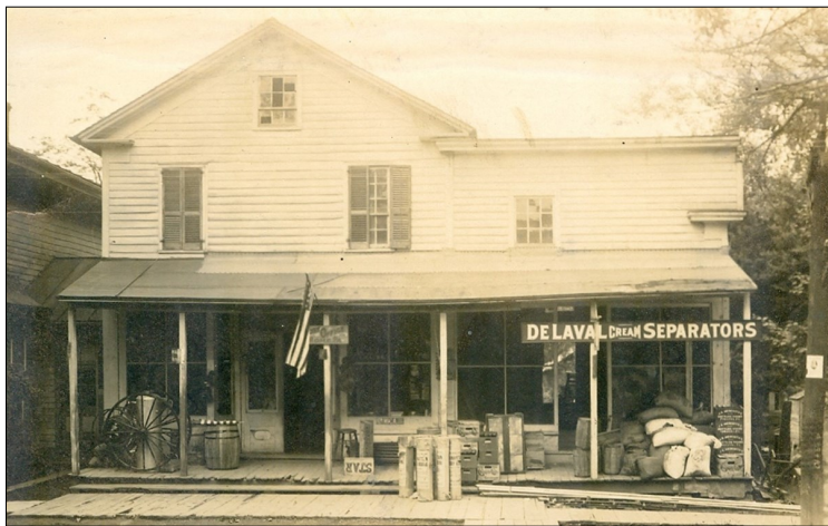
Rome Post Office and General Store

In 2018 this and several other Ulster buildings were demolished to make way for an expanded intersection.